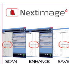
Awarded Nextimage software to ensure image quality for both archival and printing