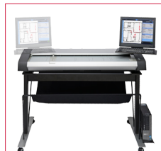
Choice of operating the touch-screen from left or right side

Context Head Office Phone: +45 4814 1122 info@context.com