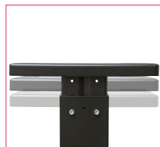
Height adjustable stand for optimal ergonomics

Designed for the best possible productivity , reliability, quality and versatility — day after day.